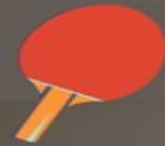
TABLE TENNIS • FOOSBALL • CARROM

OPEN ALL WEEK (except during Sunday School)